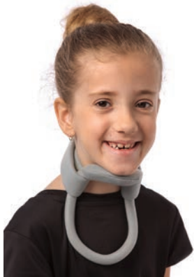
Pediatric Headmaster Collars are softer and may be fitted to children as young as 6 months.